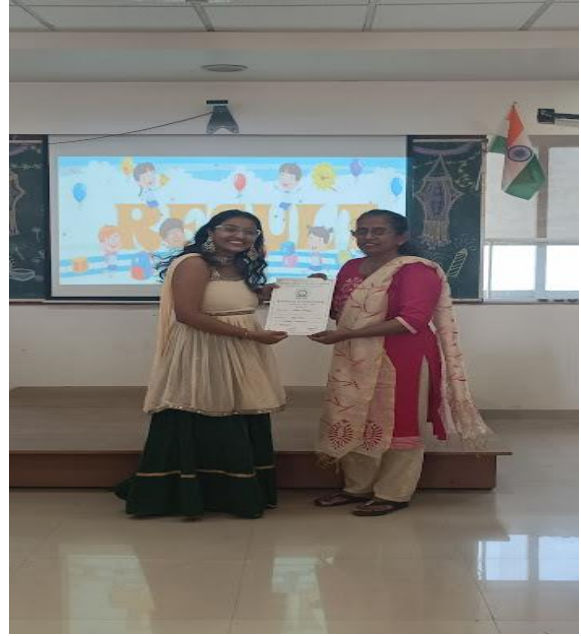
Certificates Distribution Ceremony